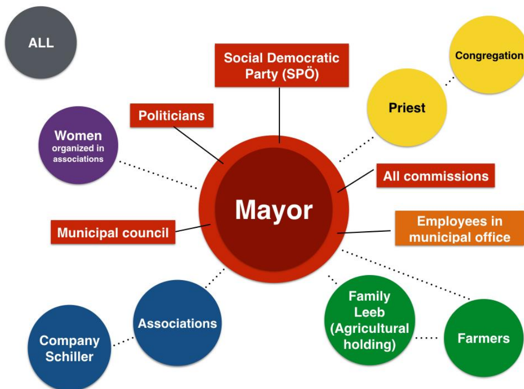
Figure 2. Community-graph of Baumgarten, a small Austrian municipality (Ehmayer, 2010b, p. 27)

A community-graph combines analysis and diagnosis, which makes it an invaluable knowledge base for the following intervention. It shows who has to be integrated into a comprehensive municipality development process and who has not been involved so far. Thus, the analysis begins first as a visualization of the currently relevant groups, which is later complemented by those groups who should play a more active role in the future development.